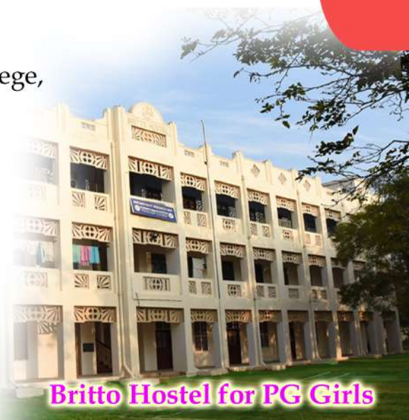
Britto Hostel for PG Girls