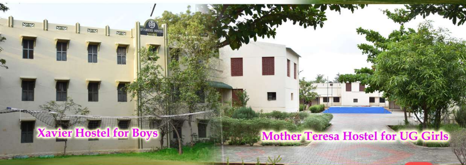
Xavier Hostel for Boys