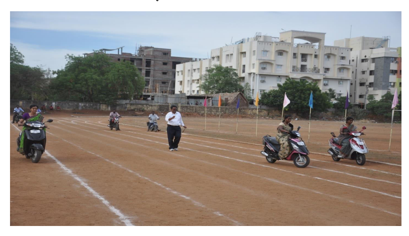
Competitions for girl students: