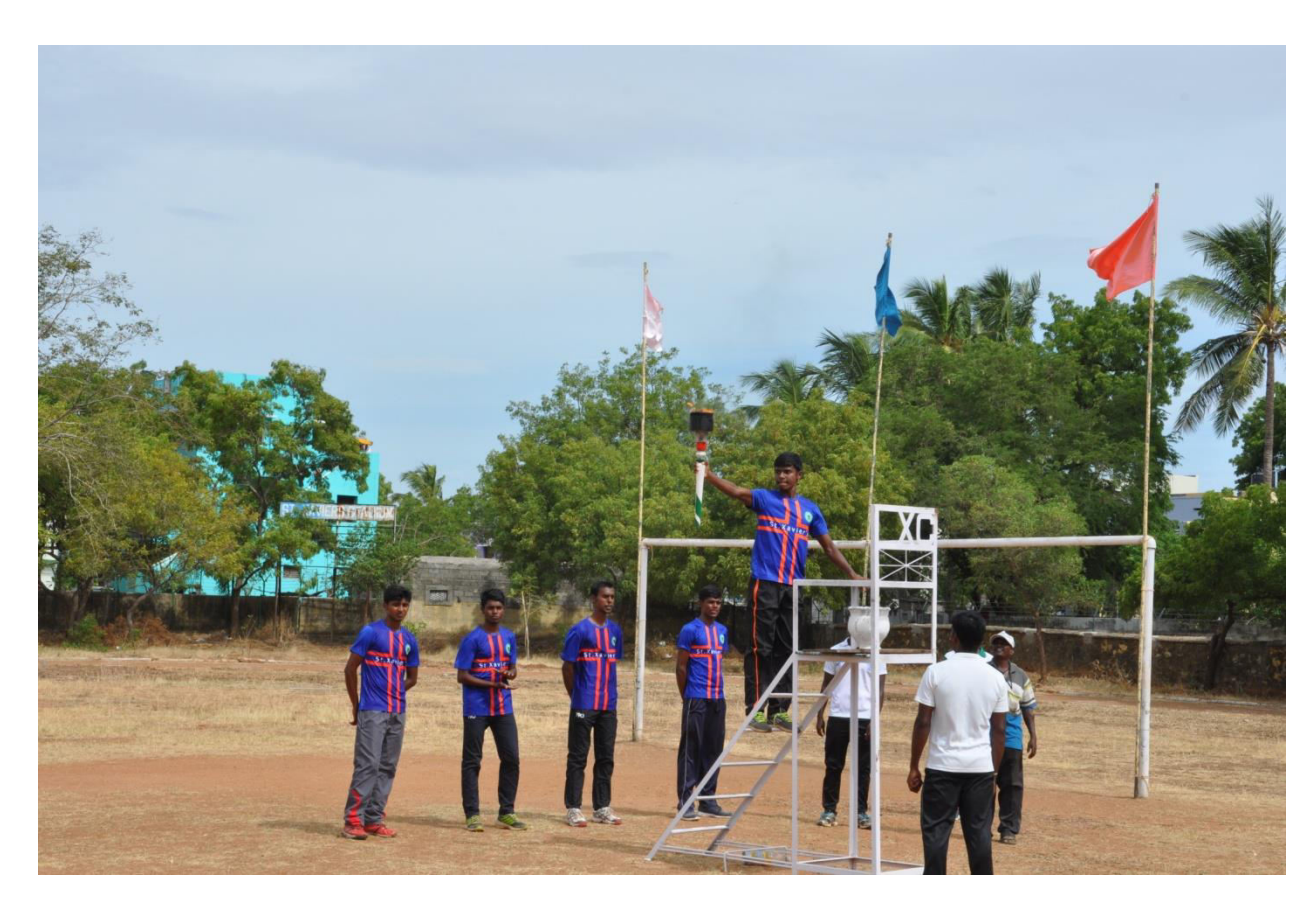
Sports Day Events: