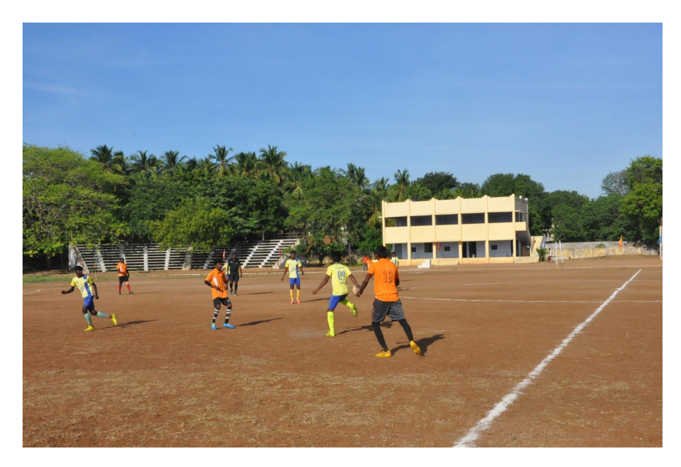
Lighting the torch in Sports Day: