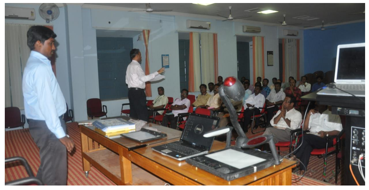
SHIFT - II