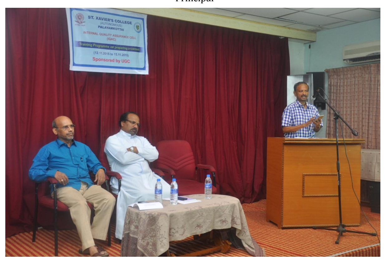
Themes of the Seminar